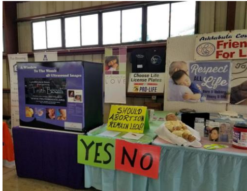
Truth Booth at the Fair (on left) – A big thank you to the Knights of Columbus for their help at the fair (setting up and manning the booth).

We had a wonderful time at the fair, August 10-15. For the first time, we had a double booth area to accommodate the Truth Booth, provided by Lifeworks, Ohio. It played a repeating video of babies in the womb. We added 54 names/emails to our list and heartily welcome all you newcomers!